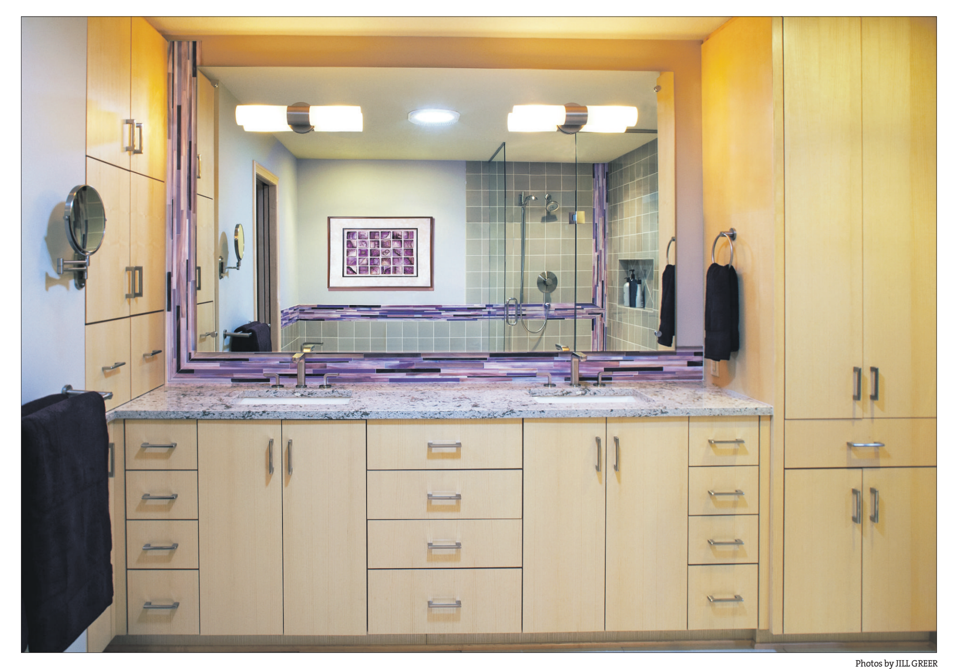
Lilu Interiors designed a clean-lined contemporary master bathroom featuring light maple cabinets, Cambria vanity top, improved task lighting and cozy heated floors.