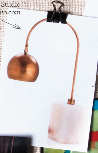
Lamp, pillows and chairs, Dwell Studio (several retail locations) dwellstudio.com