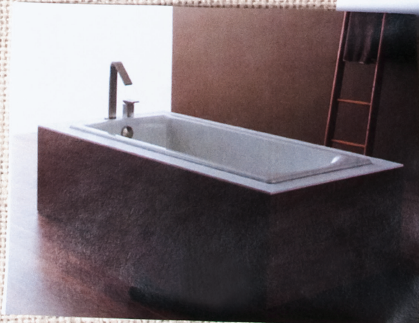
Biove drop-in tub (several retail locations), kohler.com

LIFESTYLE: "Mommy a-go-go" SHE IS: Ridiculously productive SHE LIVES: Kenwood or Crocus Hill STYLE: A healthy home, surrounded by high style and low-maintenance, crisp-but-eclectic taste LOVES: Cooking, a good read, running, hosting dinner parties, family travel, farmers markets SHOPS AT: J. Crew, Melly, Pink Champagne, Bumbershute DINES AT: Butcher and Boar, Bachelor Farmer, Spoonriver