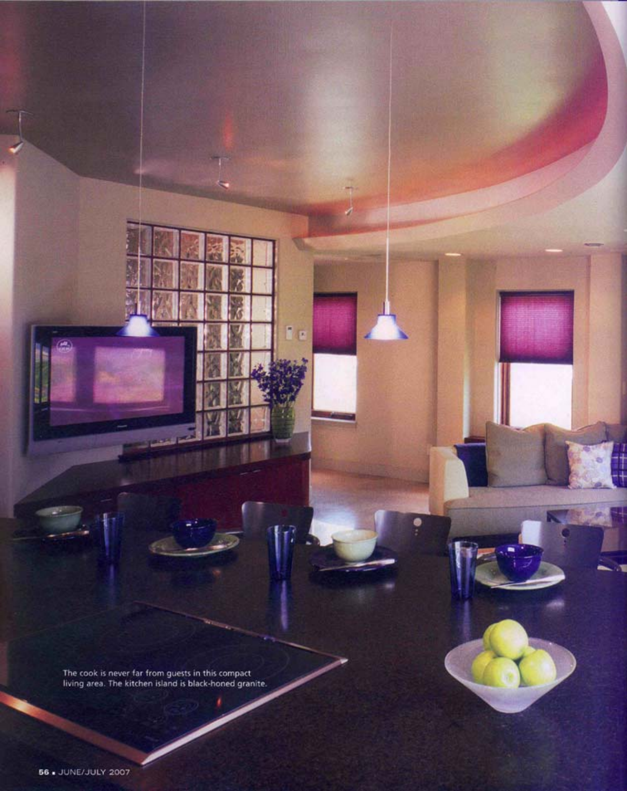
The cook is never far from guests in this compact living area. The kitchen island is black-honed granite.