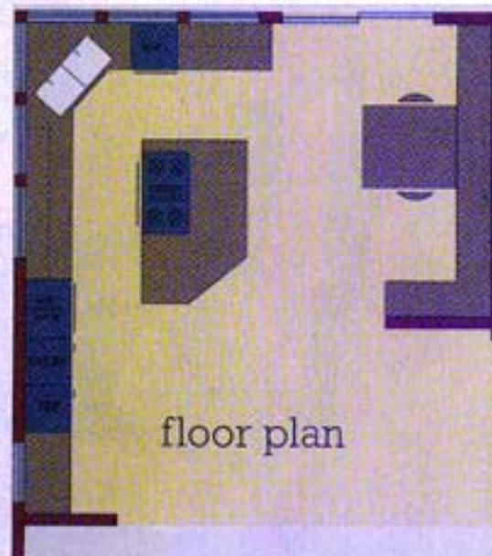
OPPOSITE: A good designer knows when to leave parts of a kitchen in place and replace what's dated. In this design that meant new cabinets, a larger eating area, more display space.